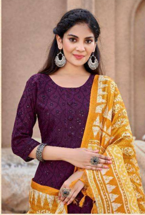
Glance Dashing in a 1002