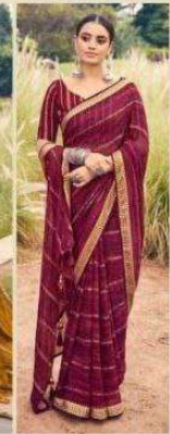
↕ DN | 12018 ↕