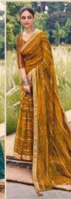
↕ DN | 12017 ↕