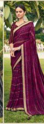
↕ DN | 12013 ↕