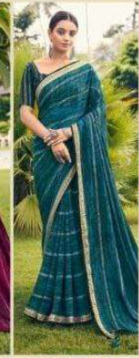
↕ DN | 12014 ↕