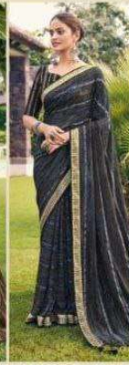
↕ DN | 12012 ↕