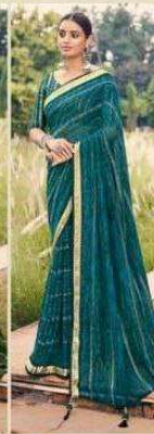
↕ DN | 12016 ↕