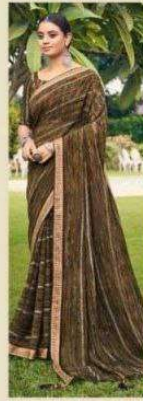
↕ DN | 12011 ↕