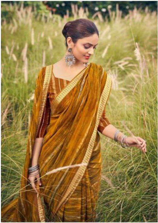
Let's Gather BLOSSOM COLLECTION | DN | 12017