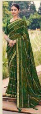
↕ DN | 12015 ↕