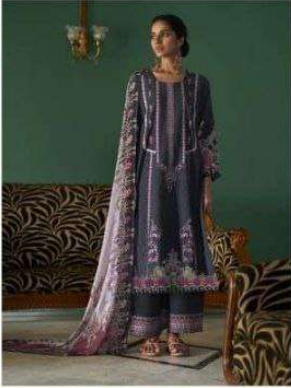
D. No. 8883