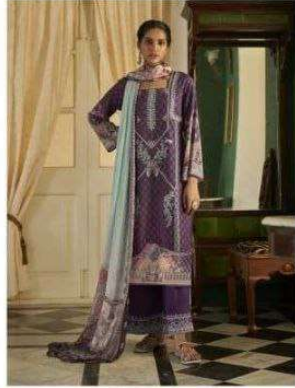
D. No. 8884