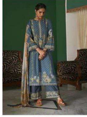
D. No. 8885