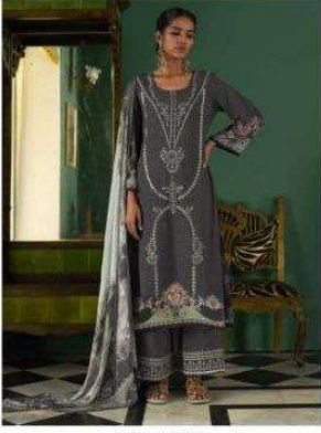
D. No. 8881