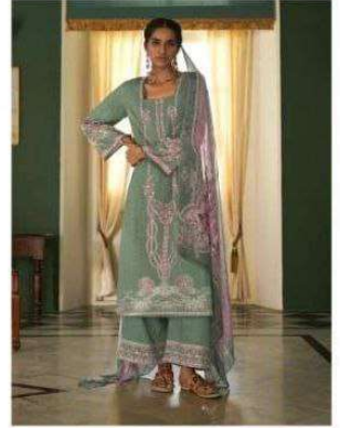
D. No. 8888