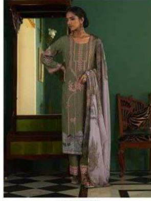
D. No. 8882