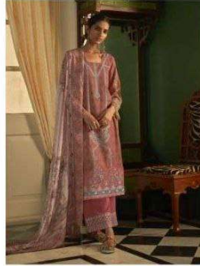
D. No. 8887