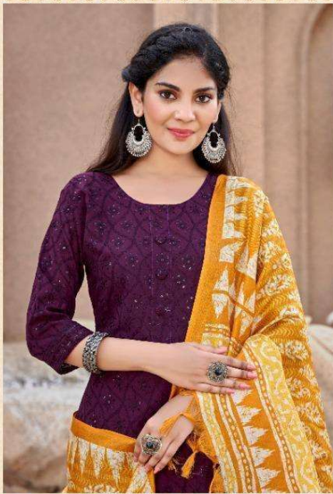
Glance Dashing in a 1002