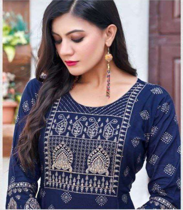
Traditional looks into the season with a hint of modern-ness!