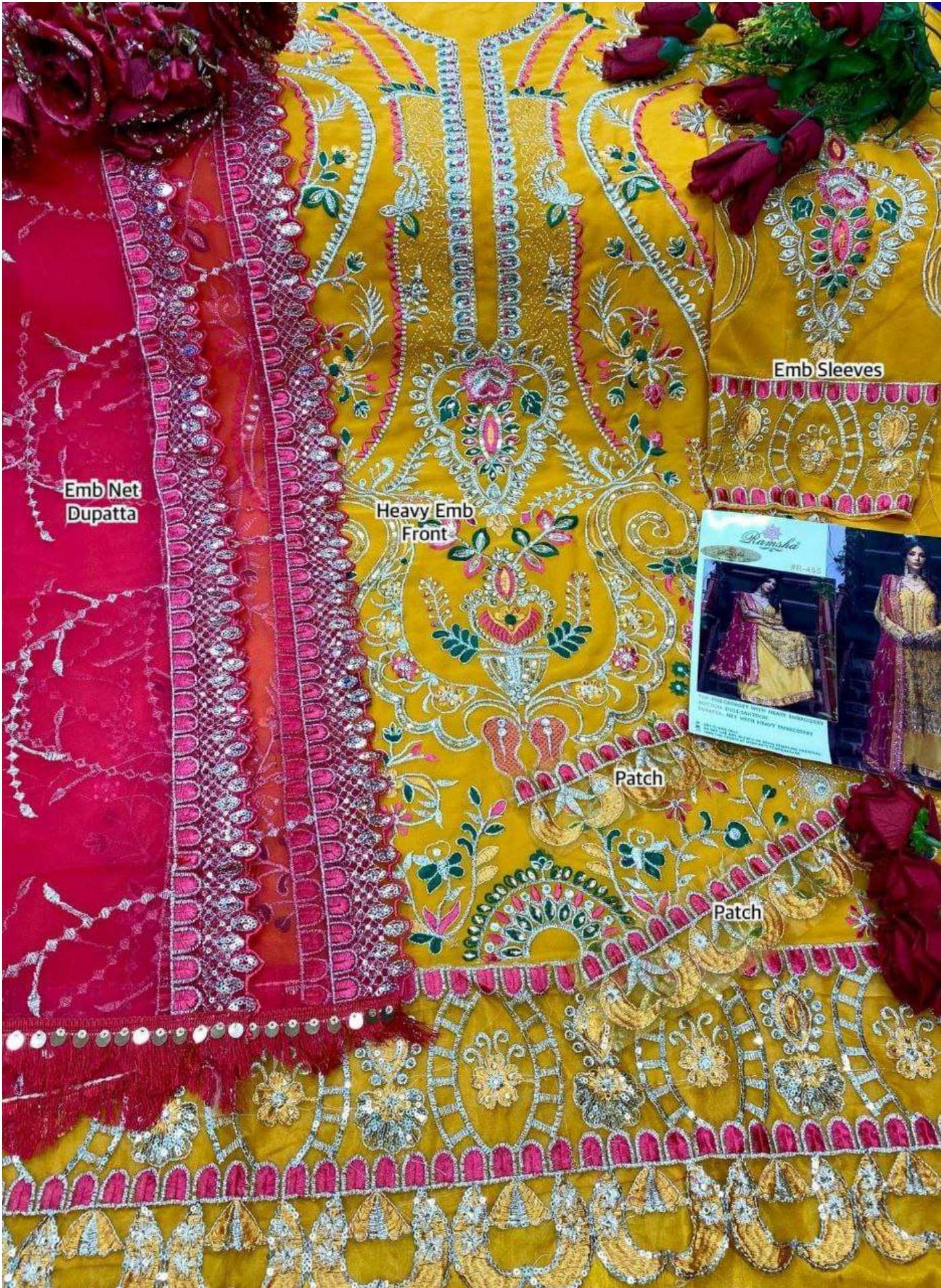
Emb Net Dupatta