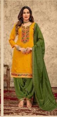
• 14012 •