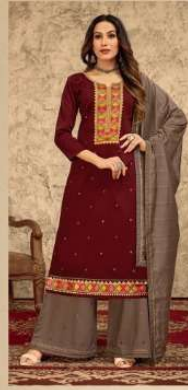
• 14011 •