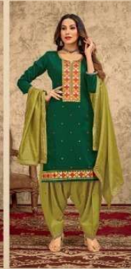
• 14015 •