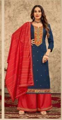
• 14013 •