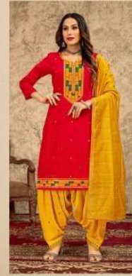
• 14014 •