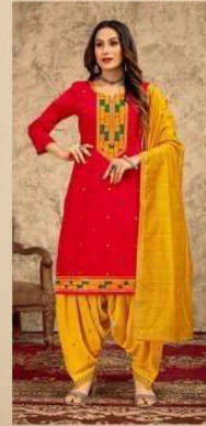
• 14014 •