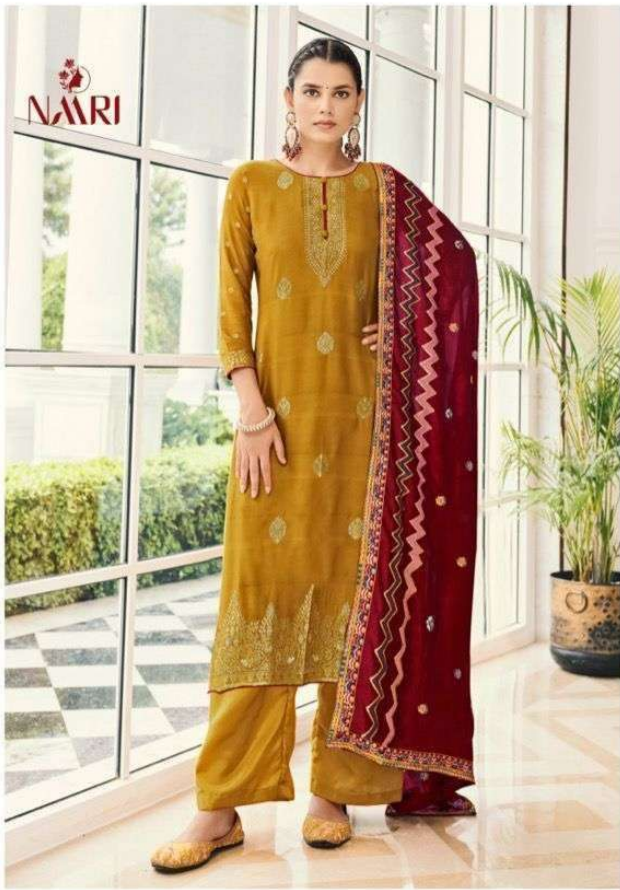
TUNE WITH SENSES THIS SEASON. D.No.084