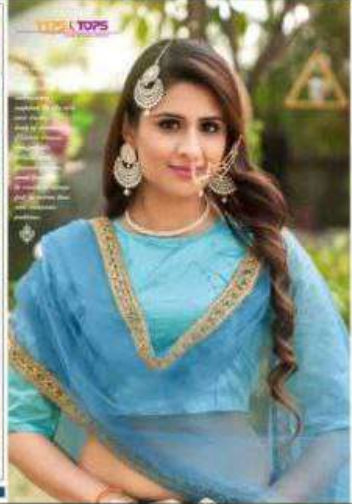
LIFE'S A TOPS