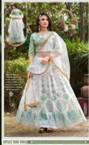
REPLACE YOUR TROUSERS