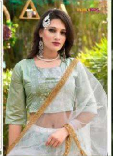
LIFE'S A TOPS