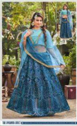
THE SPINNING GIBBY