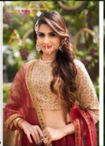
LIFE'S A TOPS