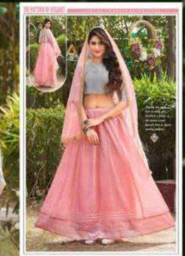
THE PATTERN OF VESPERTINE