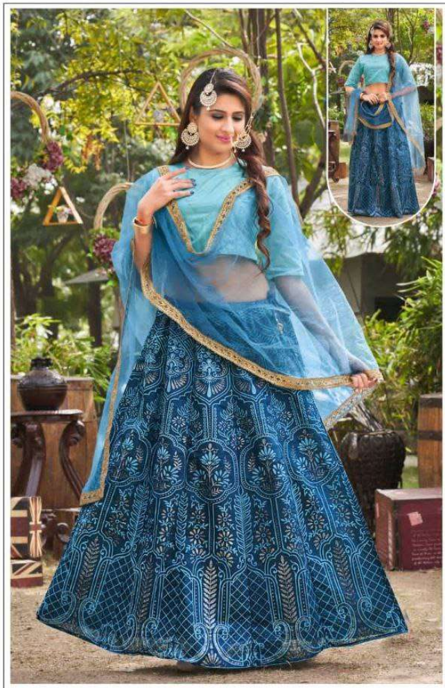
THE SPILLOVER EFFECT → signature piece is one that has our iconic style and top quality craftsmanship, all in one object ←