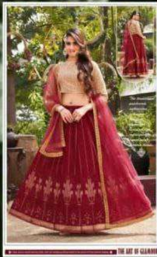
THE ART OF GALLANTRY