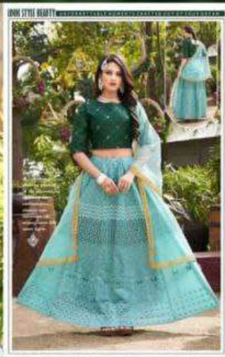
LOOM STYLE BEAUTY