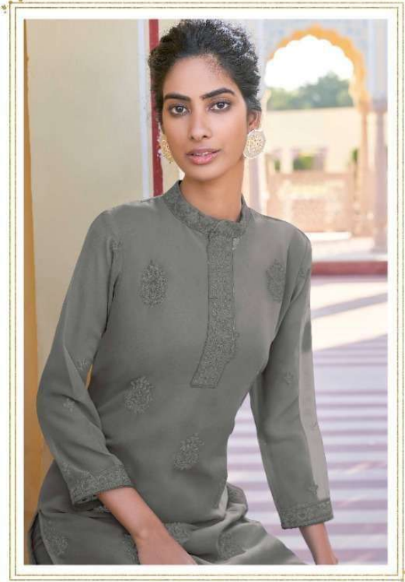
C-L-A-S-S-Y #KURTADESIGNSTOINSPIREYOUINYOURNEXTLOOK 19026