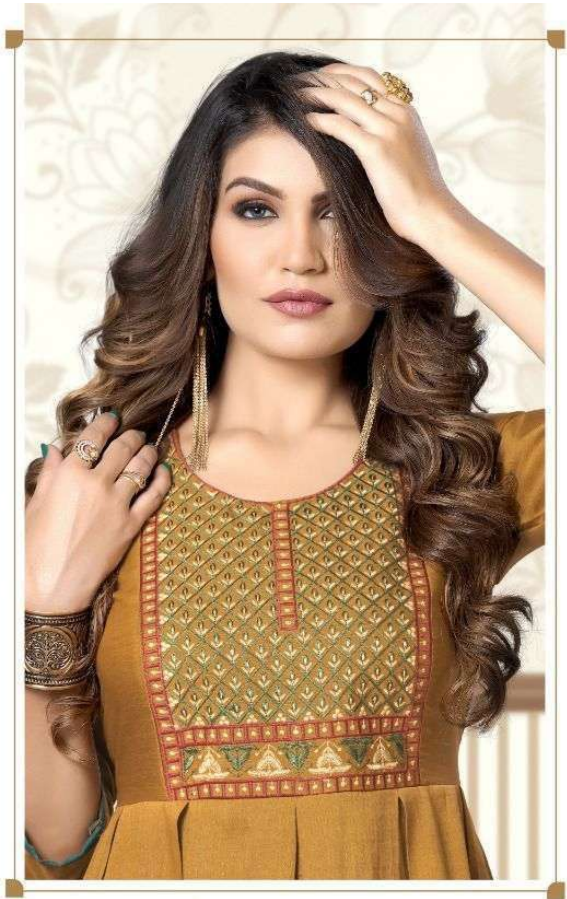
ETHNIC SENSE Turn every head your way as you stroll across in an outfit from the new gorgeous collection, celebrate your classy side with this perfect concoction of chic style