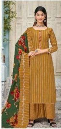
•• 7002 ••