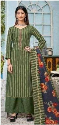
•• 7005 ••