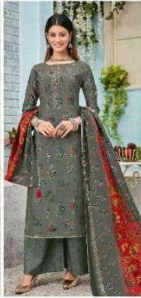
•• 7003 ••