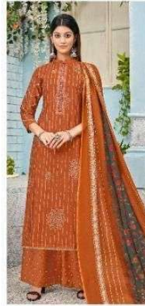
•• 7004 ••