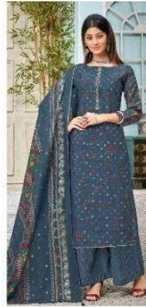
•• 7008 ••