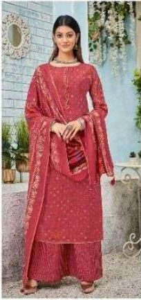
•• 7001 ••