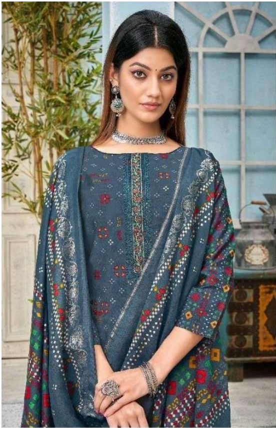
Classic outfits with a twist of interesting detailing, subtle sheen, rich texture is perfectly wrapped in saree giving style a new meaning and refresh your wardrobe to Indian culture.