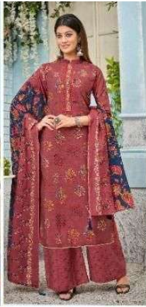
•• 7006 ••