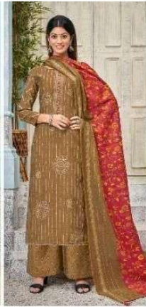
•• 7007 ••