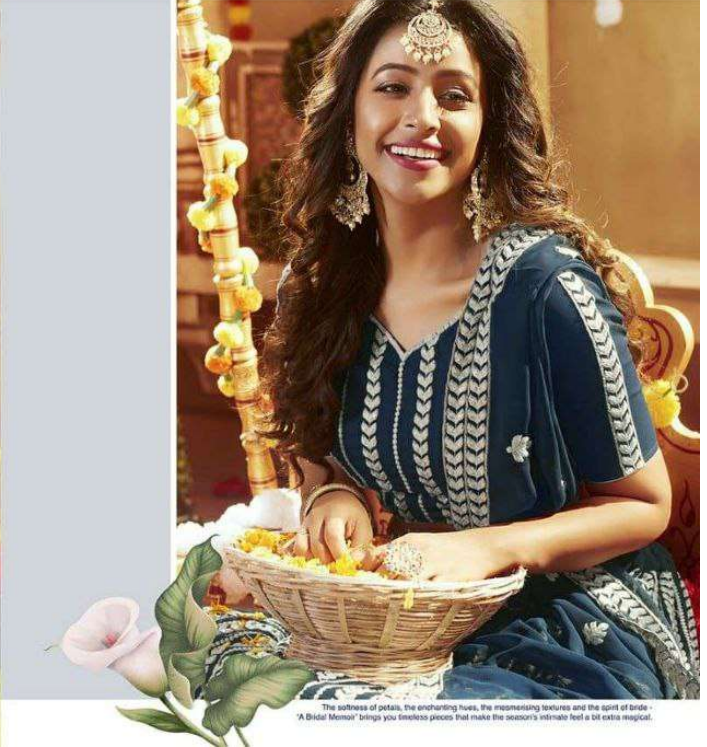
The softness of petals, the enchanting hues, the mesmerizing textures and the spirit of bride - "A Bride's Moment" brings you timeless pieces that make the occasion's intimate feel a bit extra magical!

Wispy Wonders: Classics with a contemporary twist are always top picks! शी matee fashion