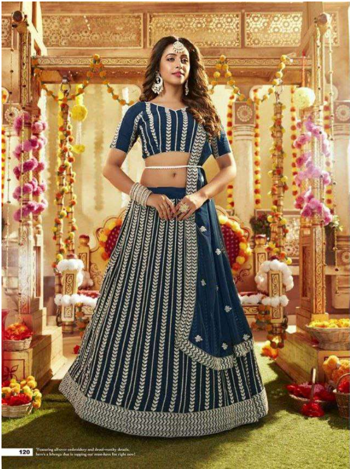
120 Flattering off-over embroidery and dand-worthy details, here's a lehenga that's rapping our man down the right way!

Wispy Wonders: Classics with a contemporary twist are always top picks! शी matee fashion