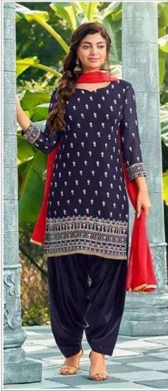
* 2025 *