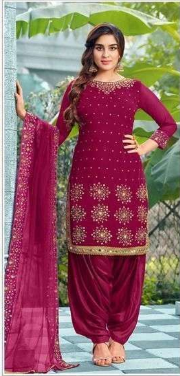
* 2027 *