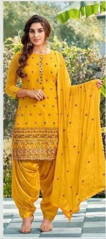
* 2026 *