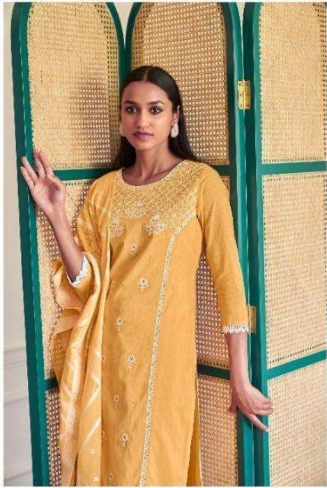
four buttons Dignity, Elegance & Balance FB-1973