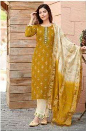
D. NO- 3003