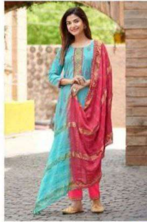
D. NO- 3005