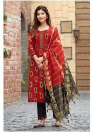
D. NO- 3006