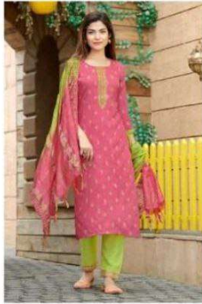
D. NO- 3002