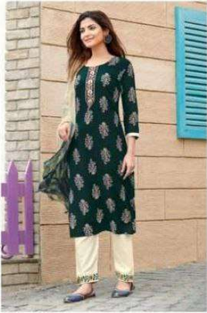
D. NO- 3001