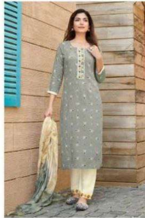
D. NO- 3007