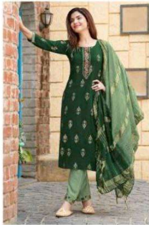
D. NO- 3004