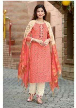
D. NO- 3008