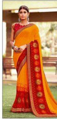
D.NO. - 1007