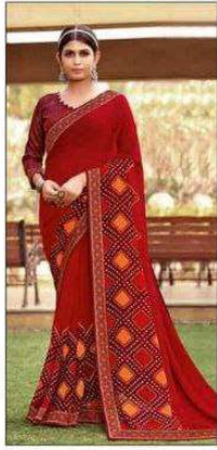
D.NO. - 1001