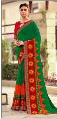
D.NO. - 1003