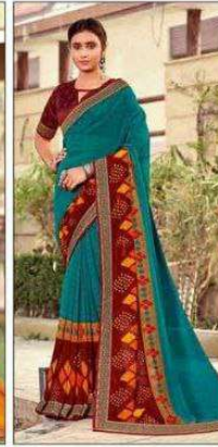
D.NO. - 1008