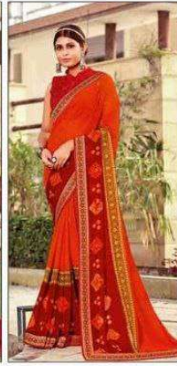
D.NO. - 1002