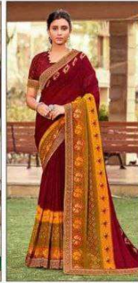
D.NO. - 1004