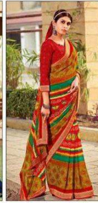
D.NO. - 1006