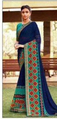
D.NO. - 1005