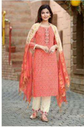
D. NO- 3008