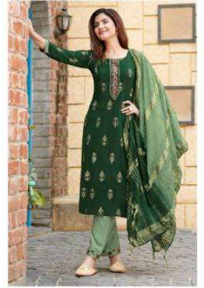
D. NO- 3004