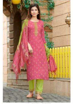
D. NO- 3002