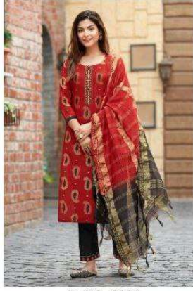
D. NO- 3006