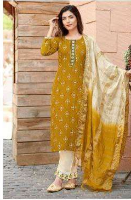
D. NO- 3003