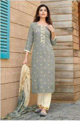
D. NO- 3007