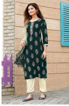
D. NO- 3001