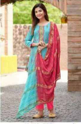
D. NO- 3005