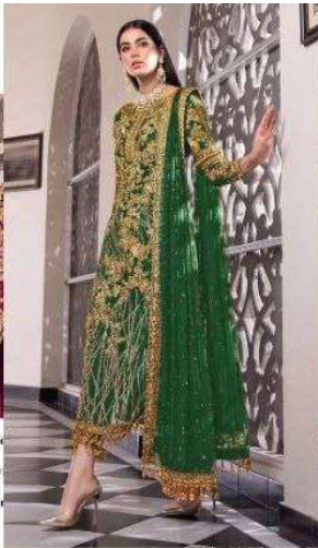
Serene by MEGHA EXPORT S - 64 C