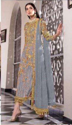
Serene by MEGHA EXPORT S - 64 E