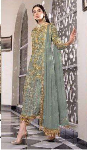
Serene by MEGHA EXPORT S - 64 G