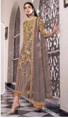
Serene by MEGHA EXPORT S - 64 F