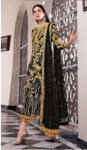
Serene by MEGHA EXPORT S - 64 D