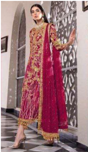
Serene by MEGHA EXPORT S - 64 A