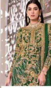
Top - Butterfly net heavy embroidery with stone Inner Bottom - Heavy santoon with emb patch Dupatta - Butterfly net embroidered with pearls