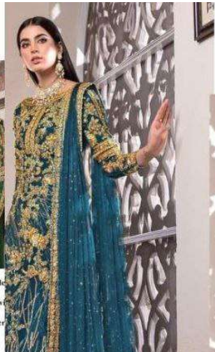
Serene by MEGHA EXPORT S - 64