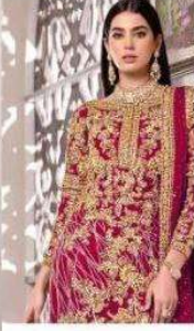
Top - Butterfly net heavy embroidery with stone Inner Bottom - Heavy santoon with emb patch Dupatta - Butterfly net embroidered with pearls