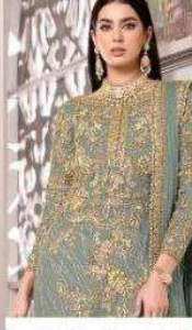
Top - Butterfly net heavy embroidery with stone Inner Bottom - Heavy santoon with emb patch Dupatta - Butterfly net embroidered with pearls