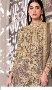
Top - Butterfly net heavy embroidery with stone Inner Bottom - Heavy santoon with emb patch Dupatta - Butterfly net embroidered with pearls