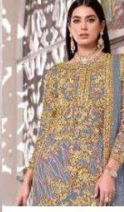
Top - Butterfly net heavy embroidery with stone Inner Bottom - Heavy santoon with emb patch Dupatta - Butterfly net embroidered with pearls