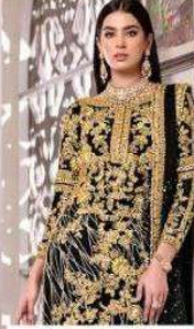
Top - Butterfly net heavy embroidery with stone Inner Bottom - Heavy santoon with emb patch Dupatta - Butterfly net embroidered with pearls