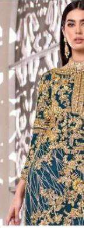
Top - Butterfly net heavy embroidery with stone Inner Bottom - Heavy santoon with emb patch Dupatta - Butterfly net embroidered with pearls