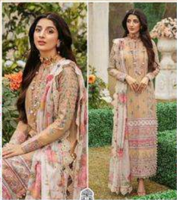
Printed Chiffon Dupatta

ZAHA D.No. 10065 TOP: Embroid Cotton with Heavy Embroidery Work | BOTTOM-INNER: Silk Laces | DUPATTA: Silk Chiffon Printed