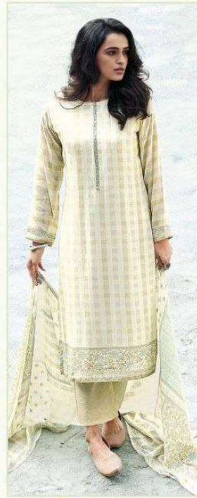
SY : Ø3