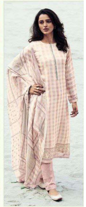
SY : Ø4