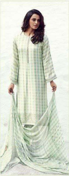
SY : 01