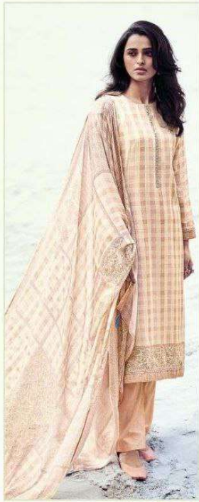
SY : Ø2