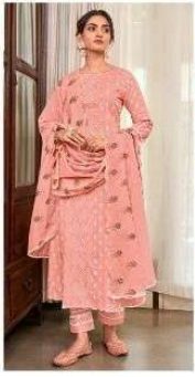
JEG | 7021