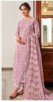
JEG | 7023