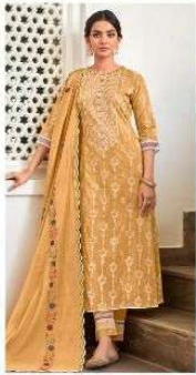
JEG | 7025