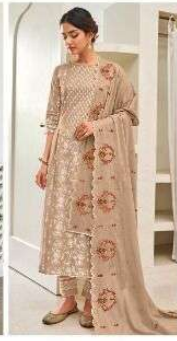
JEG | 7028