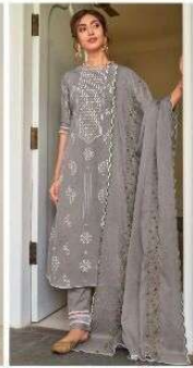
JEG | 7030