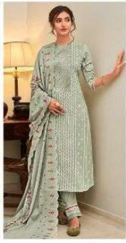
JEG | 7022