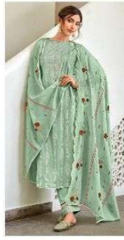
JEG | 7027