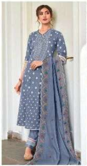
JEG | 7024