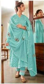
JEG | 7026