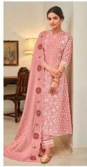
JEG | 7029