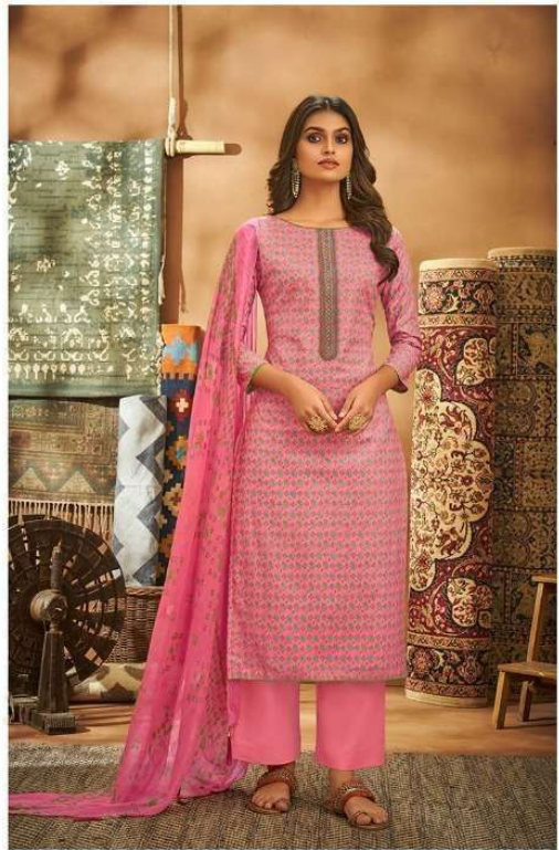
update your look with bright colors PMLAK-719