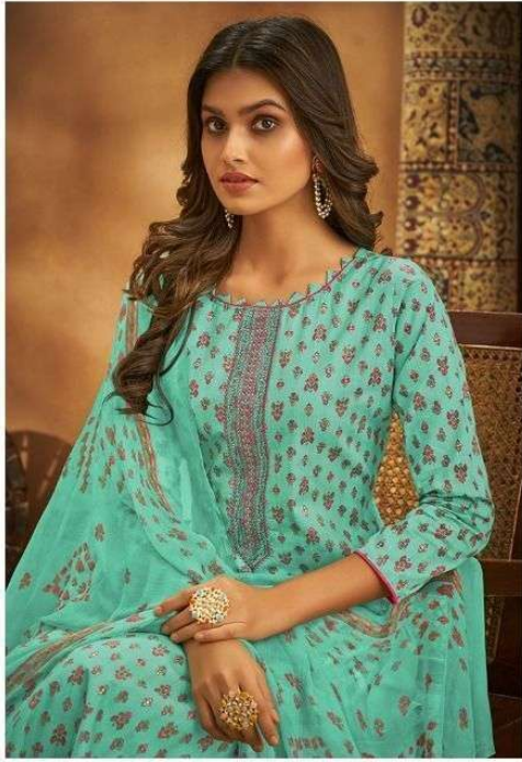
This season celebrate the magnificent festival PALAK-712