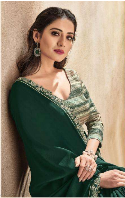
D ISTINCTIVE DESIGN Emerald green saree paired with multi-colored striped digital printed sequins and floral embroidery Emerald green saree