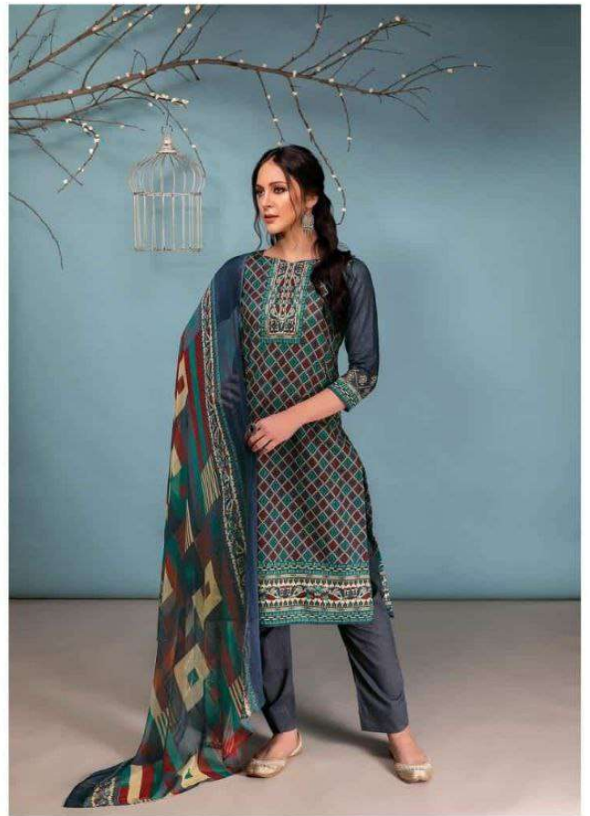
D. No. 1983 B