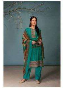
D. No. 1982 A