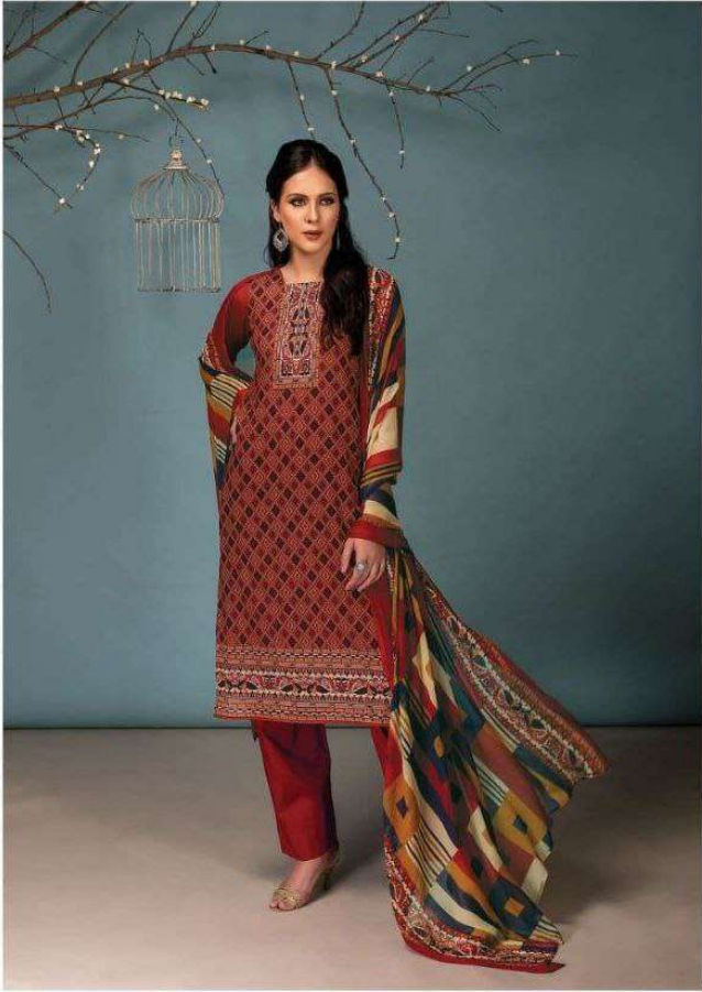
D. No. 1983 A