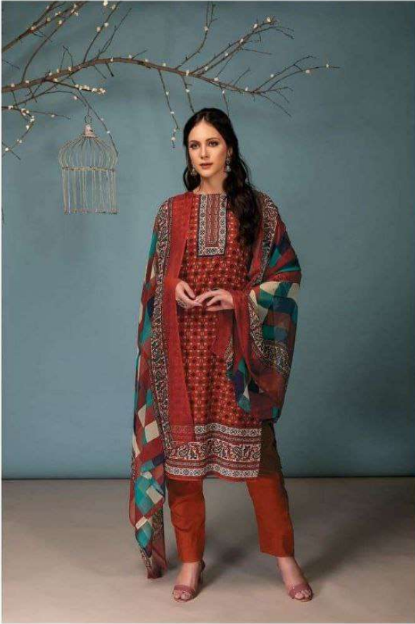
D. No. 1981 A