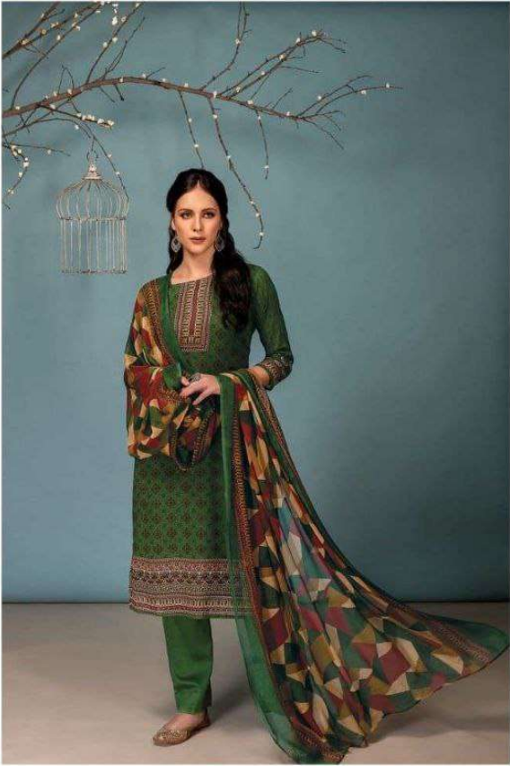
D. No. 1984 A