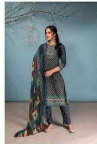
D. No. 1983 B