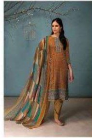
D. No. 1982 B