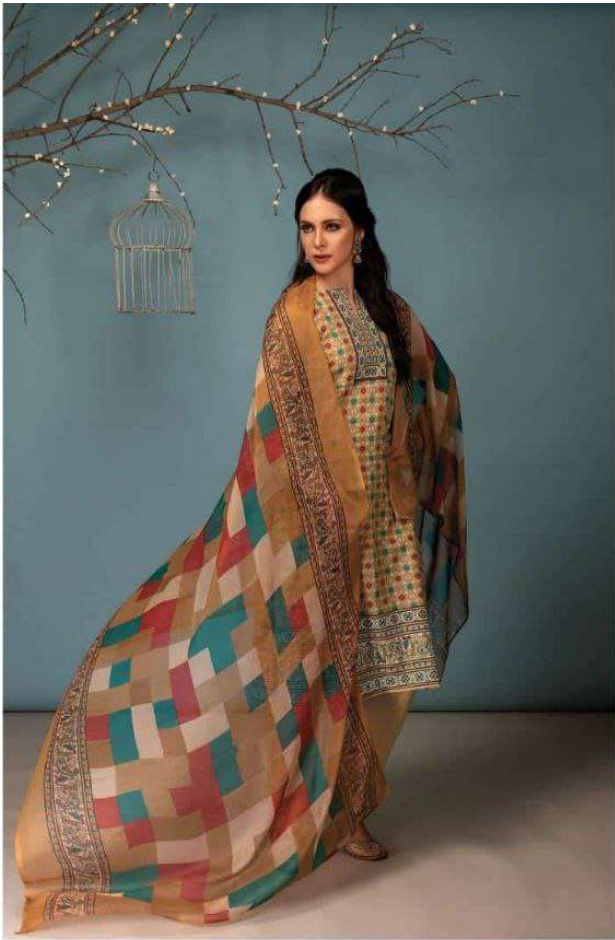
D. No. 1981 B