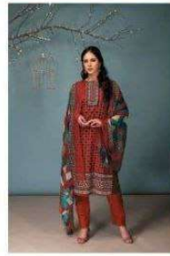
D.No. 1981 A