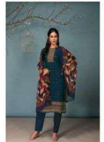
D. No. 1984 B