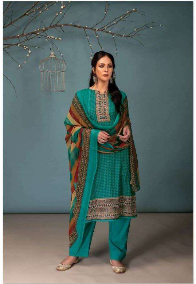
D. No. 1982 A