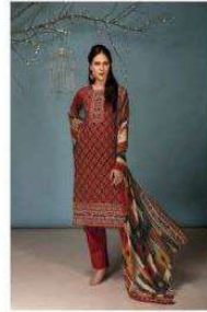
D. No. 1983 A