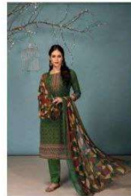
D. No. 1984 A