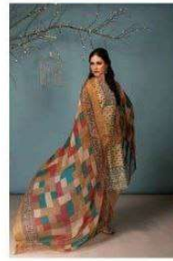
D. No. 1981 B