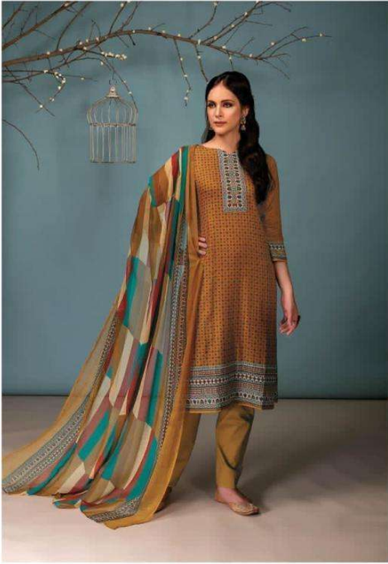
D. No.1982 B