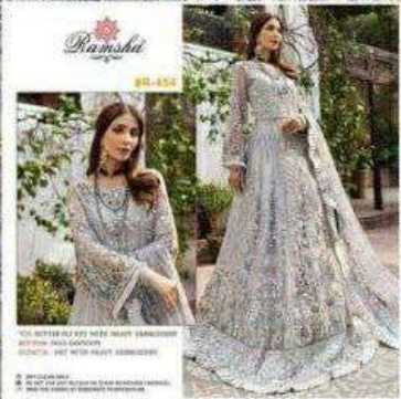
Emb Net Frill Dupatta