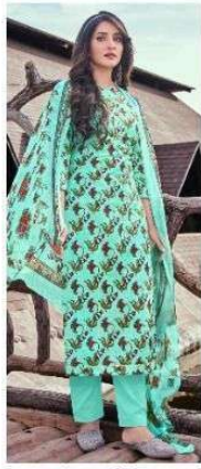
● 2008 ●