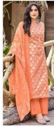
● 2009 ●