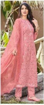
● 2006 ●