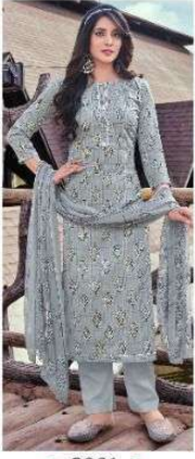
● 2001 ●