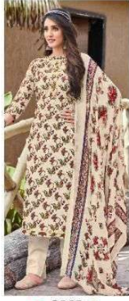
● 2003 ●