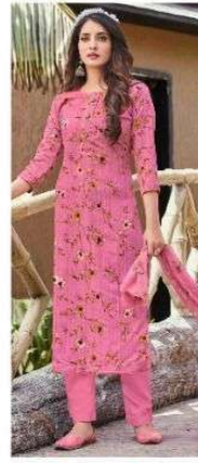
● 2010 ●