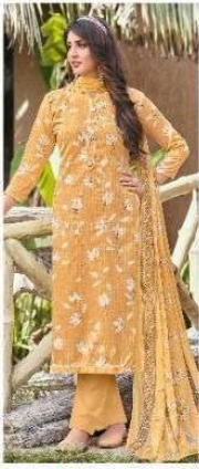
● 2007 ●