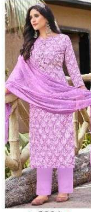
● 2004 ●