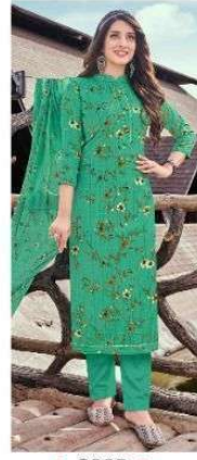
● 2005 ●