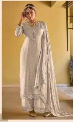
2169 - L