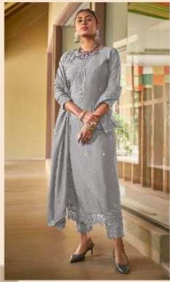
2173 - L