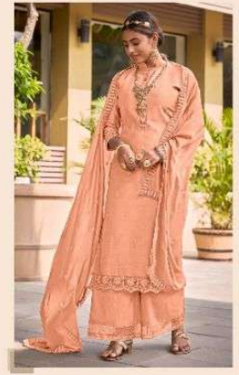
2172 - L