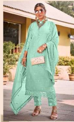
2174 - L