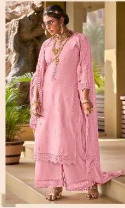
2170 - L