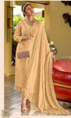
2171 - L