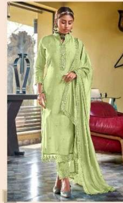
2175 - L