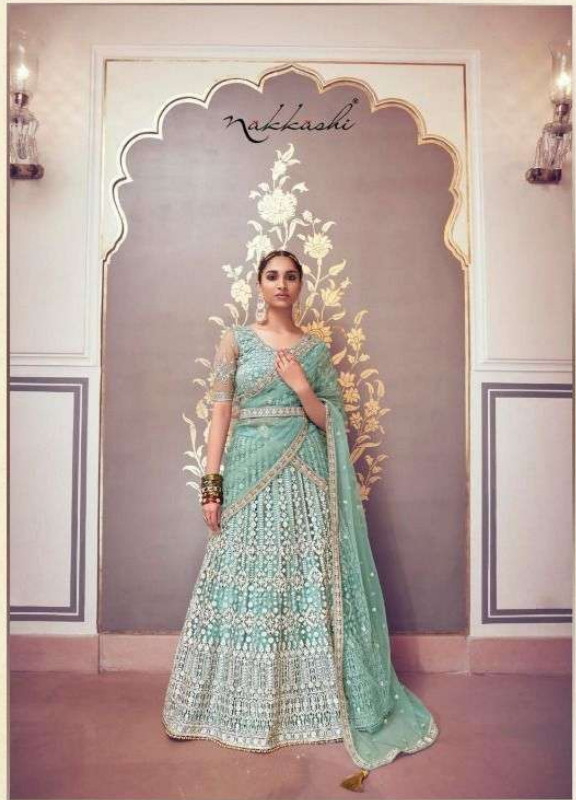
AQUA BLUE NET LEHENGA HAVING MIRROR WORK ON IT AND DECORATED WITH JIRKA, HAVING SAME COLOUR NET DUPATTA WITH ZARI AND JIRKA WORK ON IT, PAIRED WITH SAME COLOUR EMBROIDERY BLOUSE AND BELT