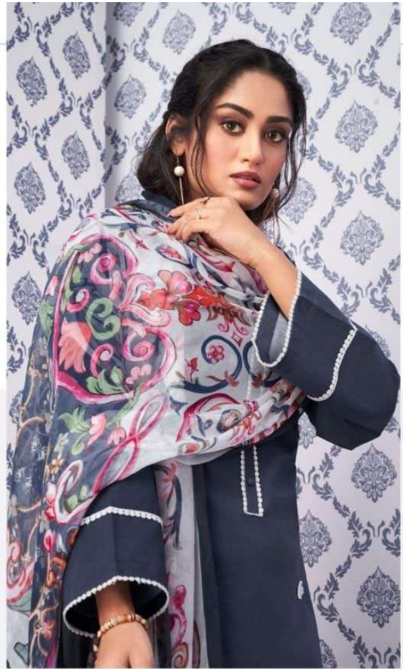
WONDER BLOSSOM • 380