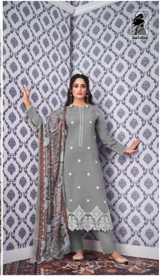
WONDER BLOSSOM • 396