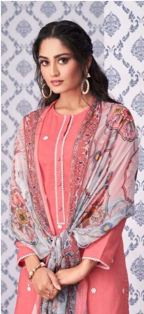
WONDER BLOSSOM • 348