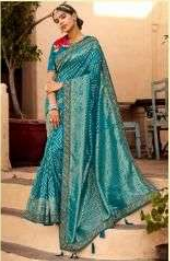
D.NO :- 2107