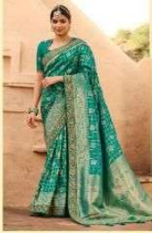
D.NO :- 2105