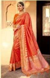
D.NO :- 2108