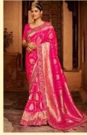
D.NO :- 2103