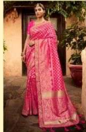
D.NO :- 2109