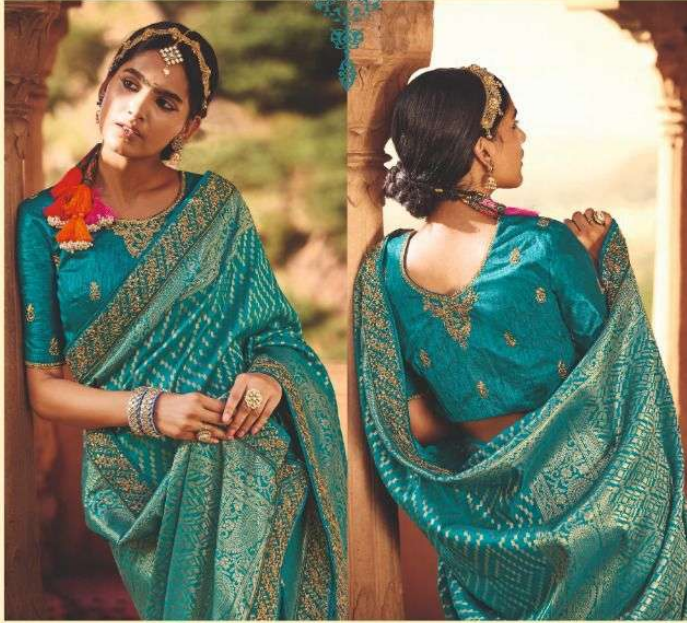
D.NO : - 2107