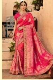
D.NO :- 2106