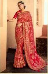
D.NO :- 2104