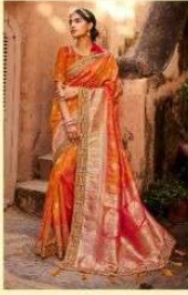
D.NO :- 2102