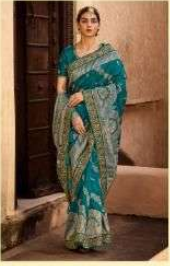
D.NO :- 2101