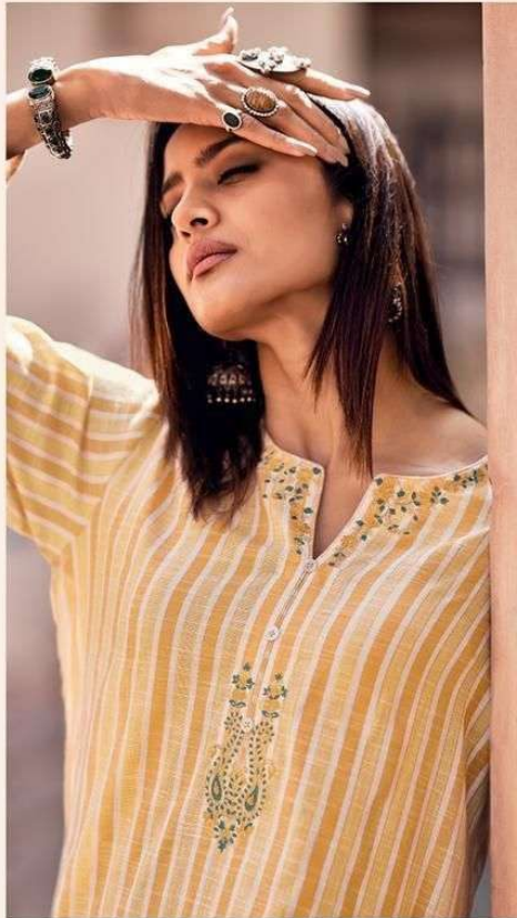
SV:14 | Keep it simple.