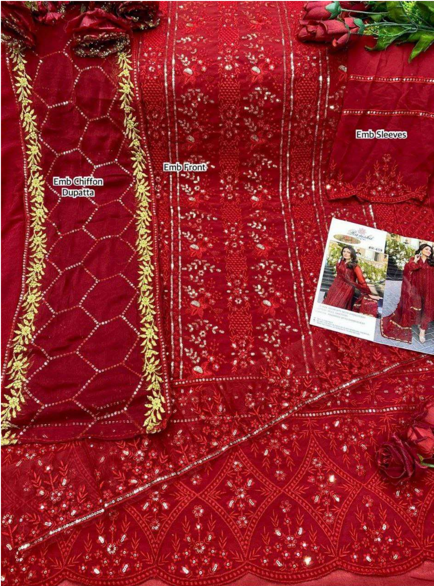
Emb Chiffon Dupatta