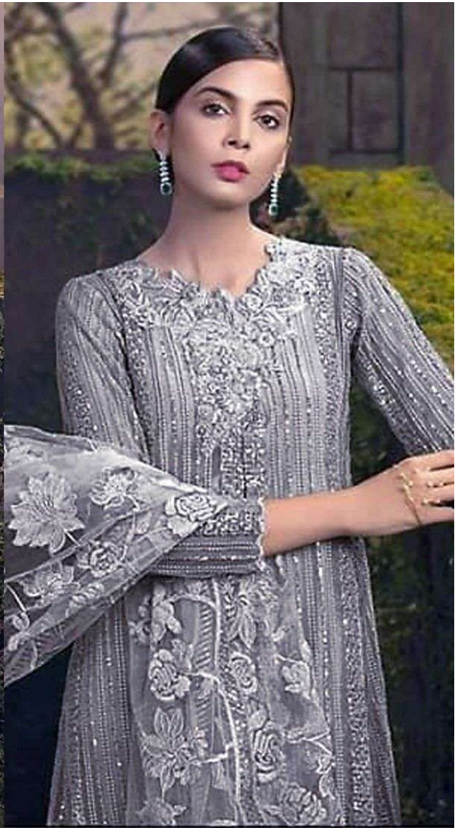
Top - Butterfly net heavy embroidered with lace neck patch Inner Bottom - Heavy santoon Dupatta - Butterfly net heavy embroidered