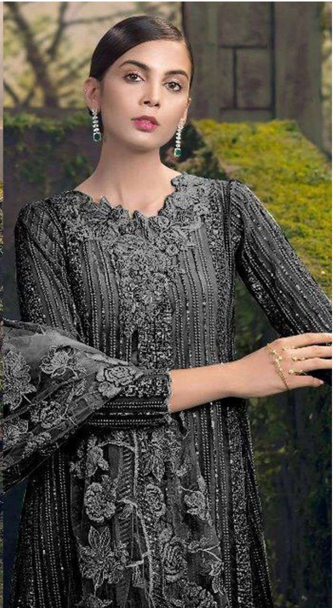
Top - Butterfly net heavy embroidered with lace neck patch Inner Bottom - Heavy santoon Dupatta - Butterfly net heavy embroidered