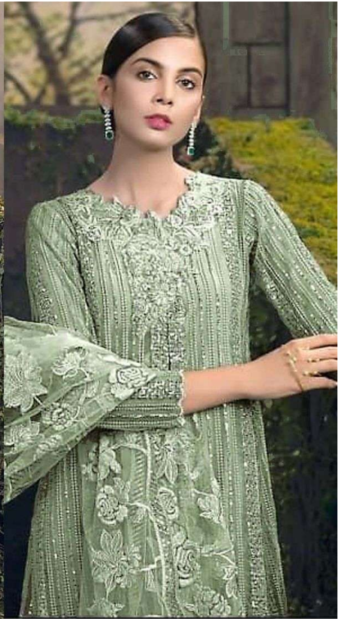
Top - Butterfly net heavy embroidered with lace neck patch Inner Bottom - Heavy santoon Dupatta - Butterfly net heavy embroidered