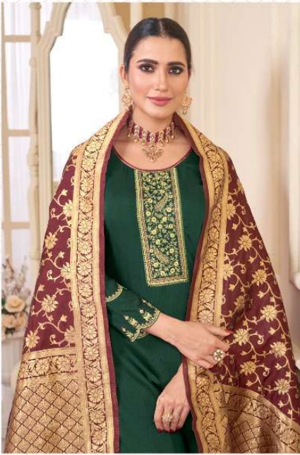
You can have anything you want in life if you dress for it.