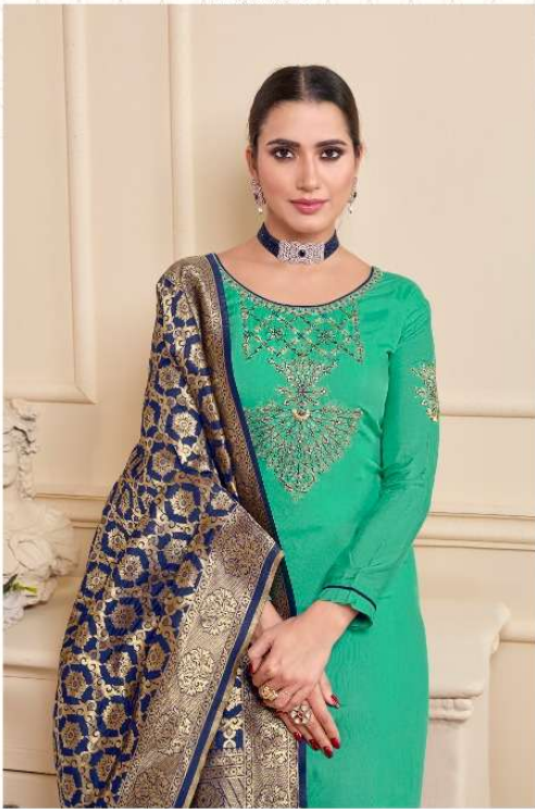
We must never confuse elegance with snobbery.