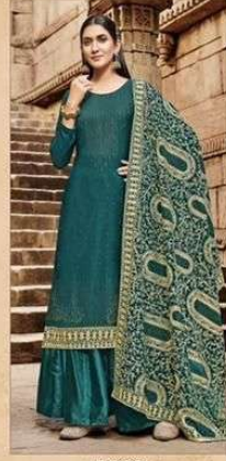
* 7003 *