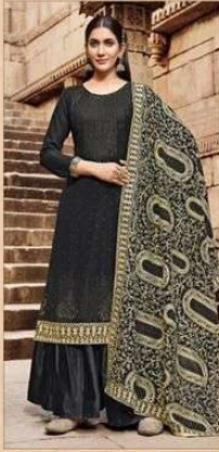
* 7004 *