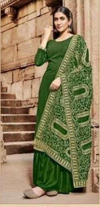
* 7001 *