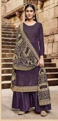
* 7002 *