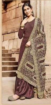
* 7005 *