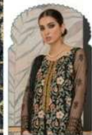
Rose BRIDAL S-105