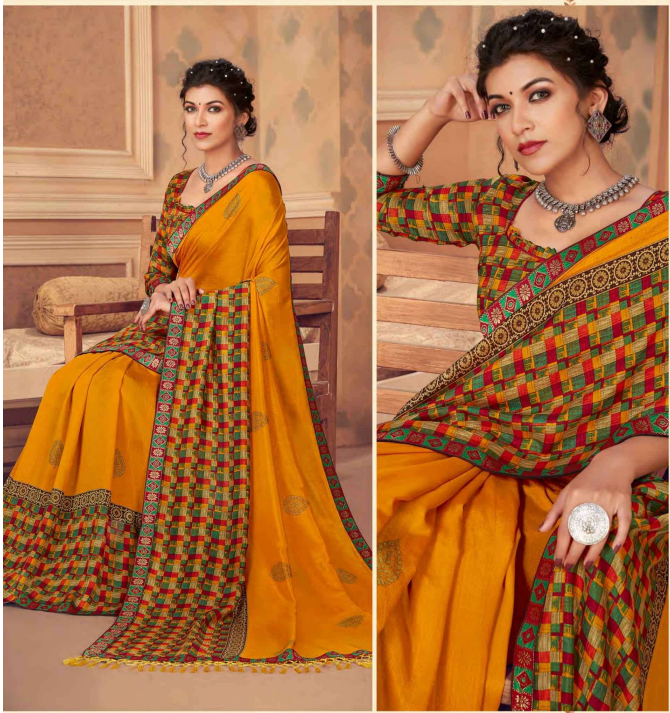
Embrace womanly attire that take inspiration from the feminine of the tradition swatting its way to a season invited with imagination fabulous designs to look beautiful.