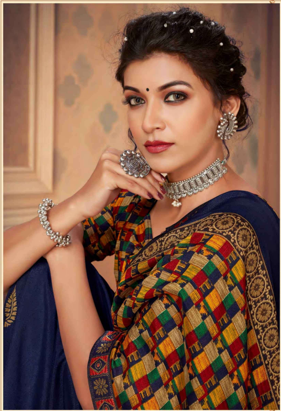
The beauty of the Indian women with gracefully drops in effulgent sarees..