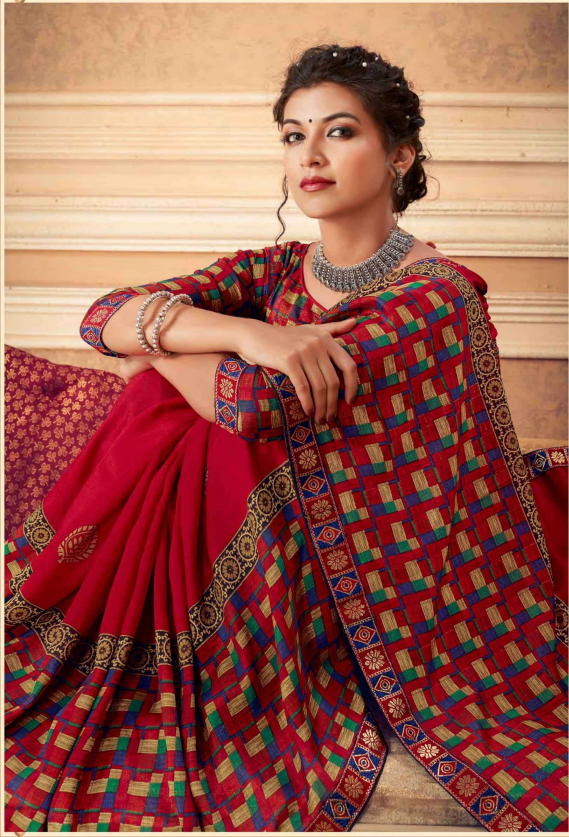
Create a perfect moment to embrace the style you have update your wardrobe this season with a lot of ethnic colours and add a unique accent to your look