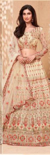
D.No. 1044 ← ୧୧ →