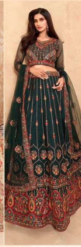
D.No. 1045 ← ୧୧ →