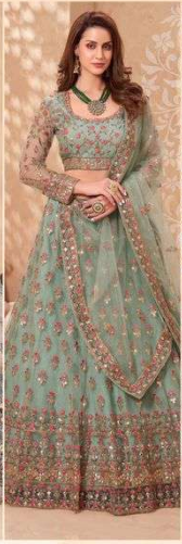
D.No. 1041 ← ୧୧ →