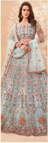
D.No. 1039 ← ୧୧ →