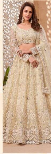
D.No. 1043 ← ୧୧ →