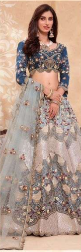
D.No. 1040 ← ୧୧ →