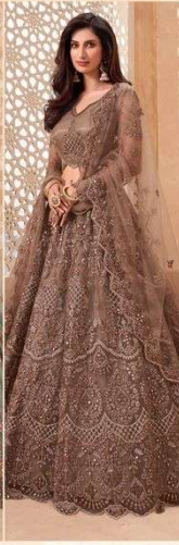
D.No. 1042 ← ୧୧ →