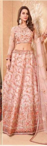
D.No. 1046 ← ୧୧ →