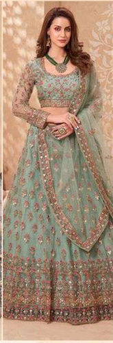
D.No. 1041 ← ୧୧ →