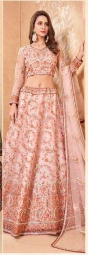
D.No. 1046 ← ୧୧ →